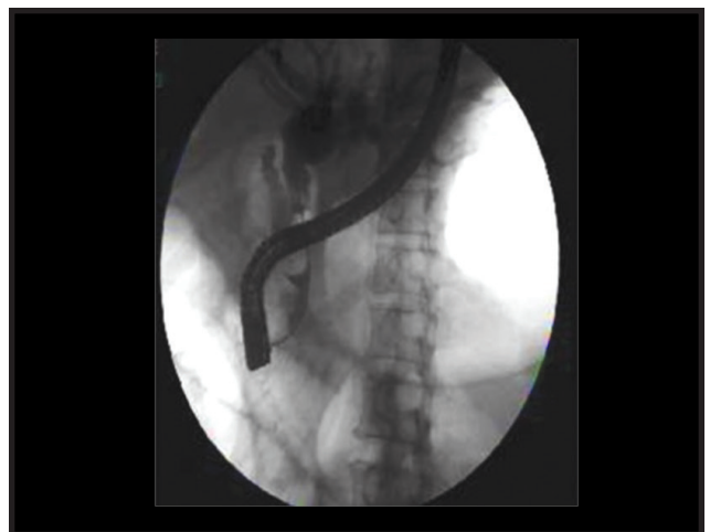
Figure 3. Fluoroscopic image of biliary tree during ERCP

crystals in the bile. The exudate manifests as a thick, radiopaque paste in the gallbladder or common bile duct. 4 MS is typically diagnosed on imaging, including abdominal X-rays and CT scan, which shows filling of the gallbladder or CBD as if contrast was administered. Prevalence of limy bile syndrome ranges between 0.1-1.7% of all surgeries for cholelithiasis with a male to female ratio of 1:3. 5