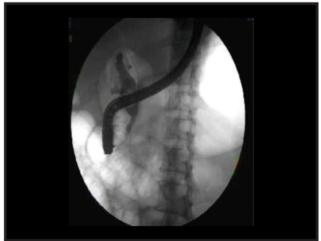
Figure 2. Fluoroscopic image during ERCP

Prolonged cholestasis in this patient led to the development of "milk of calcium" or "limy bile" exuding from the ampulla after sphincterotomy. Although the pathophysiology of "milk of calcium" is not completely understood, it is believed that obstruction of the gall bladder neck, cystic duct or CBD with subsequent biliary stasis leads to precipitation of calcium carbonate