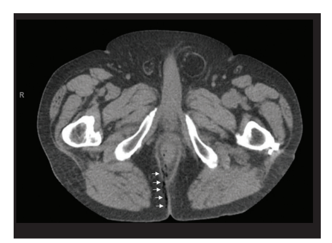
Figure 2. CT scan showing a transmural tear of the anus between 6 and 7 o'clock (arrows).

non-surgical causes. Non-surgical causes should be suspected in patients with minimal abdominal pain and distention with absent peritoneal signs, fever, and leukocytosis. There are a wide range of causes such as collagen vascular disease, diverticulosis, pneumatosis cystoides intestinalis and distended hollow viscus.<sup>2</sup> In this case we believe the cause of pneumoperitoneum was due to gradient pressure from the extreme diarrhea causing a transmural anal fissure. The patient responded well to conservative management, thus we deemed that emergent surgical intervention was not required.