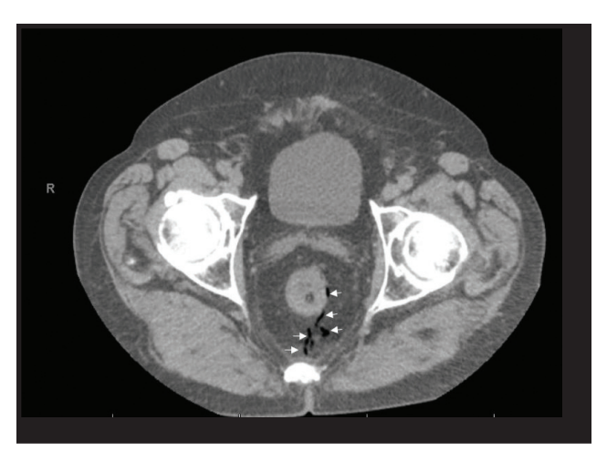
Figure 1. CT scan showing free air in the perianal space (arrows).

non-surgical causes. Non-surgical causes should be suspected in patients with minimal abdominal pain and distention with absent peritoneal signs, fever, and leukocytosis. There are a wide range of causes such as collagen vascular disease, diverticulosis, pneumatosis cystoides intestinalis and distended hollow viscus.<sup>2</sup> In this case we believe the cause of pneumoperitoneum was due to gradient pressure from the extreme diarrhea causing a transmural anal fissure. The patient responded well to conservative management, thus we deemed that emergent surgical intervention was not required.